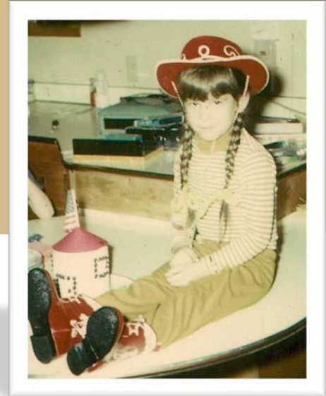
Guess who? Today she says, "I think I was born having a connection with horses from the time I was a tot."

Please look for their progress in the near future on Facebook and our blog. And if you are interested in the T&T Club, please join us! Let's let 2014 be our best year ever!!!